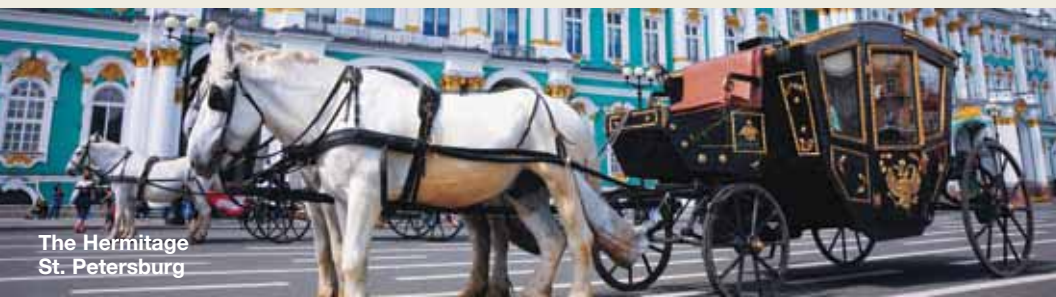
The Hermitage St. Petersburg