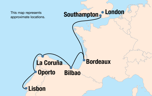
This map represents approximate locations.