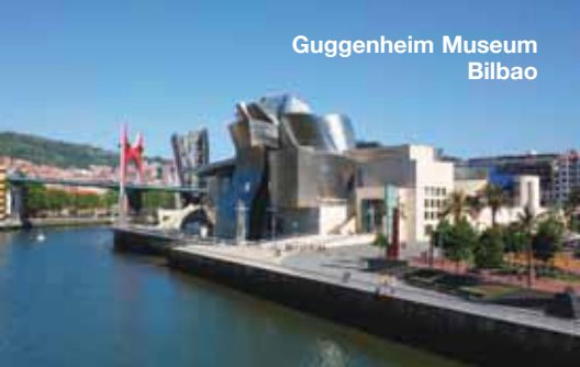
Guggenheim Museum Bilbao