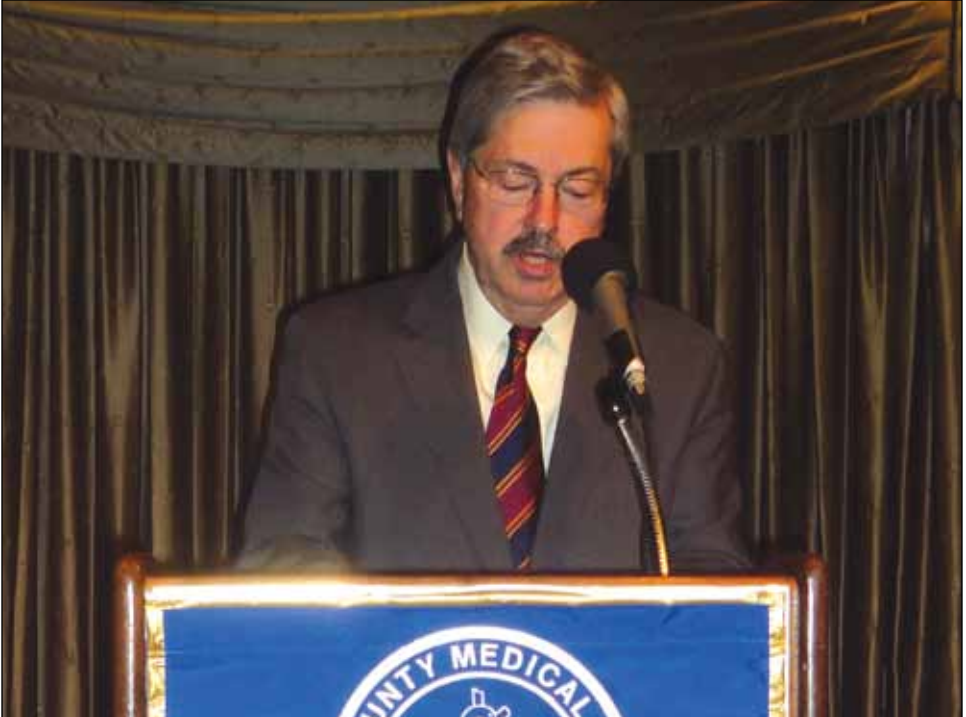
Governor Terry Branstad addressing PCMS members and guests