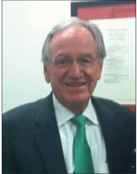
Senator Tom Harkin