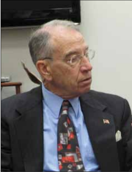
Senator Charles Grassley

discuss other important bills and health care laws that affect the practice of medicine and patients in Iowa.