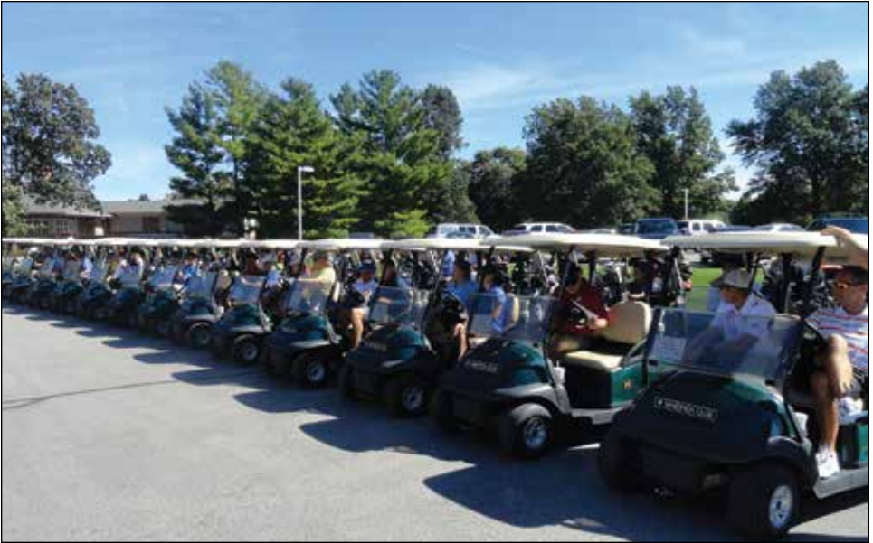
Shot Gun Start at the 3rd Annual Kathie J. Lyman Scholarship Golf Tournament.