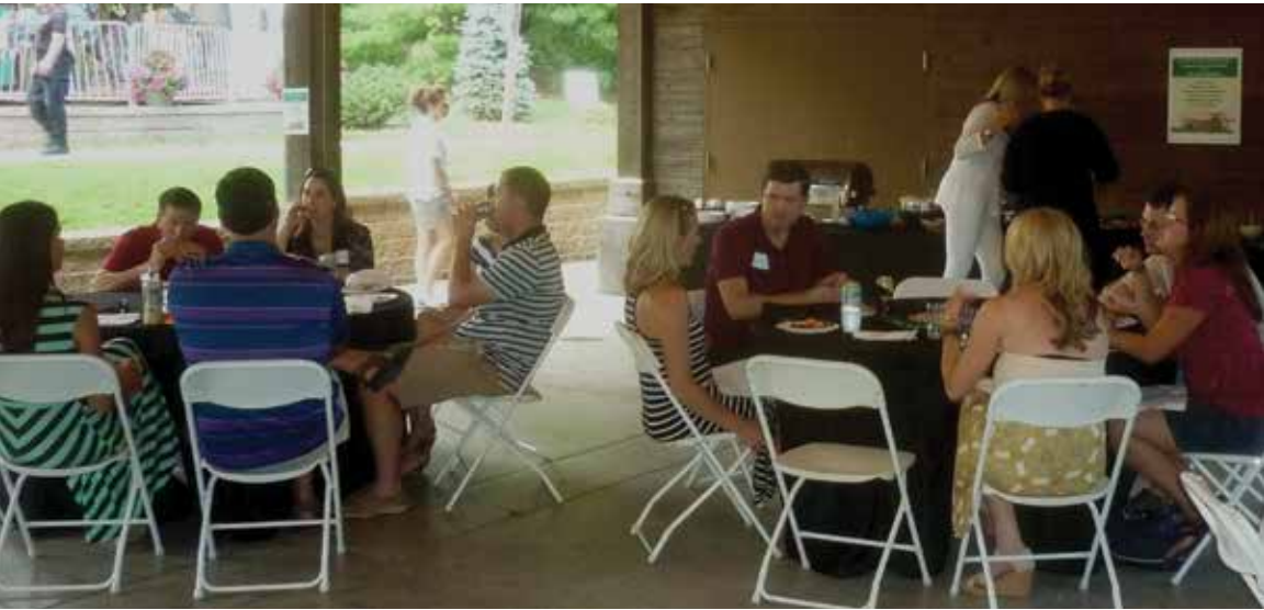
PCMS members and guests enjoy food and fun at the Zoo