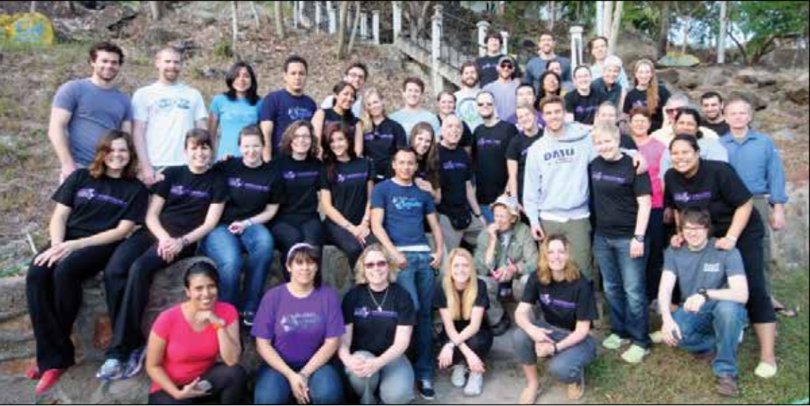
Des Moines University students and health care providers

Whereas the university provides us with a number of simulated patient encounters to give us a “life-like” experience, by no means do these simulated experiences compare to being immersed in a real clinic with real patients who all have very real needs. Many of us were nervous, not only for the unknown, but we also feared not meeting the expectations of our patients. We hoped to be able to fulfill the needs of all who sought our help; a task for even the most experienced health care provider.