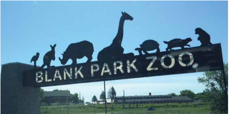
Blank Park Zoo Entrance

Young physicians and physicians young at heart attended the PCMS night at the Zoo Brew on Wednesday, June 25th, at the Blank Park Zoo. It was a “wild” night of animals, fun with family and friends, food and live music.