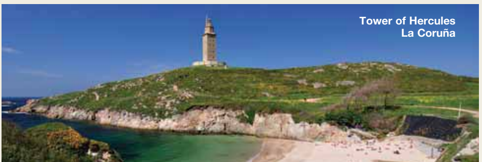
Tower of Hercules La Coruña

CALL FOR ADDITIONAL INFORMATION 800.842.9023 OR 952.918.8950 FAX: 952.918.8975 • WWW.GONEXT.COM