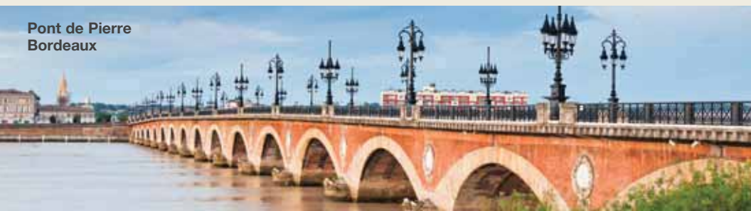
Pont de Pierre Bordeaux