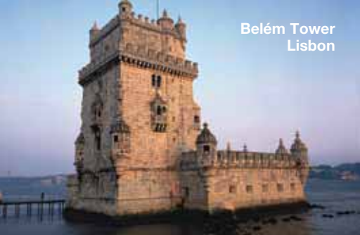
Belém Tower Lisbon